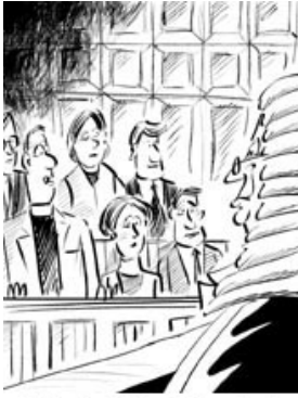
"We find the defendant guilty, but we'd like to forgive him ..."

Changes to the Criminal Justice Act were made last week which will make clergy eligible for jury service. Apparently the courts need more eligible people to draw on and so doctors politicians and clergy are being called.