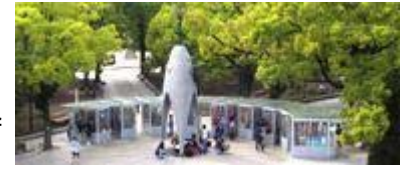
Statue of Sadako holding a golden crane at the Hiroshima Peace Memorial

just one of numerous countries that continue to be plagued by the effects of the atomic bombs that were dropped on Hiroshima and Nagasaki. The story of Sadako Sasaki provides a starting point for thinking about the need for peace. Sadako was a baby of two on August 6, 1945, unaware of the war that raged around her. On that day she lost more than her grandmother as an atomic bomb reduced the city of Hiroshima to a desert of destruction and radioactive wasteland. She survived the initial blast with seemingly no ill effects. Ten years passed and Sadako grew strong and swift. It was as she was practicing for a competition that she crumpled to the track and was taken to the hospital. There her worst fears were confirmed. She had developed leukemia as a result of her exposure to radiation. During her long hospital stays, Sadako began to fold paper cranes. According to Japanese legend, if an individual folds 1000 paper cranes, a wish will be granted. With each crane she folded, the wish was the same-to get well. October of 1955, Sasako folded her last crane-number 644, and she quietly became another of the many casualties of a war that had ended ten years earlier. Her classmates finished the remaining 366 cranes to honour Sadako's memory and to share in her wish that such bombs of destruction would never be used again. The children told Sadako's story to the world by sharing the letters they had exchanged during her hospital stay.