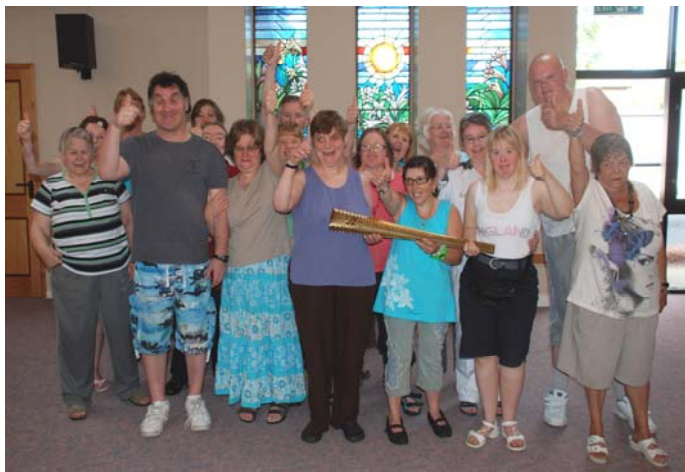
The Olympic Torch Came to Open House last week