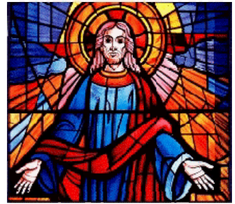
They will receive blessing from the Lord and vindication from God their saviour Psalm 21:5

(This is the word of the Lord All: Thanks be to God )