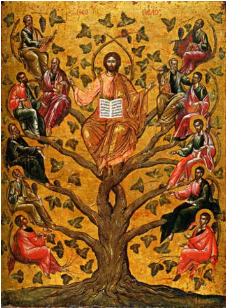
Eastern Orthodox Icon of Jesus as the True Vine

How do we remain close to Christ as he calls us to do in the reading today? How do we remain or stay in union with Him? This is a question which many people often ask? We are told that it is love which unites the believer to Christ, as a branch is grafted to the vine. Often when people speak about their faith they complain they feel far from the love of God. If by love we mean the emotion which is often spoken of as 'being in love' then this is perhaps not surprising. However what John means by abiding in the love of Jesus is shown in verse 10