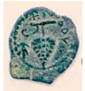
A coin from the time of Herod Archelaus, 4 BC - AD 6 Bronze, 16 mm. Cluster of grapes on a branch with Herod's name above in Greek

Jesus is the New Israel, it is in him that people will find God and find meaning for their lives.