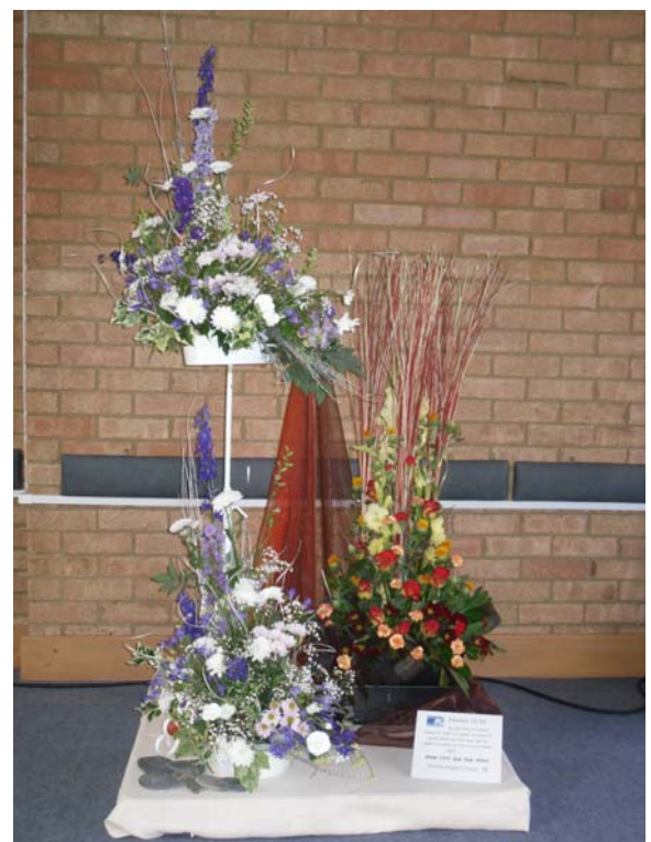
Sue Allen and Ann Hitt Exodus 13: 30 " ...a pillar of cloud by day ...and a pillar of fire by night ..."