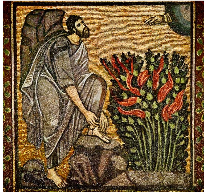
Moses with the burning bush