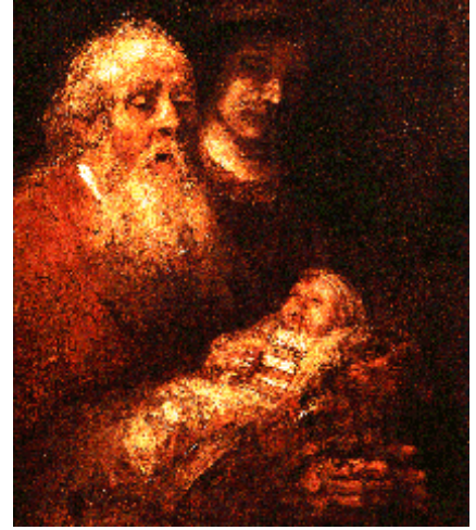
Simeon by Rembrandt

O Lord Jesus Christ, as a child you were presented in the Temple and received with joy by Simeon and Anna as Redeemer of Israel: mercifully grant that we like them, may be guided by the Holy Spirit to acknowledge and love you until the end of our lives. Amen (Church of South India)