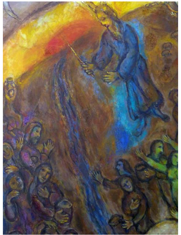
Marc Chagall Moses strikes the Rock

Jesus entered the temple courts, and, while he was teaching, the chief priests and the elders of the people came to him. "By what authority are you doing these things?" they asked. "And who gave you this authority?" Jesus replied, "I will also ask you one question. If you answer me, I will tell you by what authority I am doing these things. John's baptism—where did it come from? Was it from heaven, or from men?" They discussed it among themselves and said, "If we say, 'From heaven,' he will ask, 'Then why didn't you believe him?' But if we say, 'From men'—we are afraid of the people, for they all hold that John was a prophet." So they answered Jesus, "We don't know."