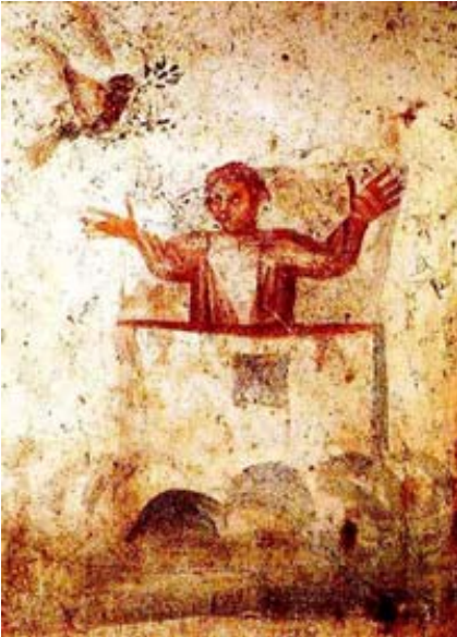
Noah and the Dove, Roman Catacomb, 2-4th century.

Then Noah built an altar to the LORD and, taking some of all the clean animals and clean birds, he sacrificed burnt offerings on it. The LORD smelled the pleasing aroma and said in his heart: "Never again will I curse the ground because of humans, even though every inclination of the human heart is evil from childhood. And never again will I destroy all living creatures, as I have done. "As long as the earth endures, seedtime and harvest, cold and heat, summer and winter, day and night will never cease."