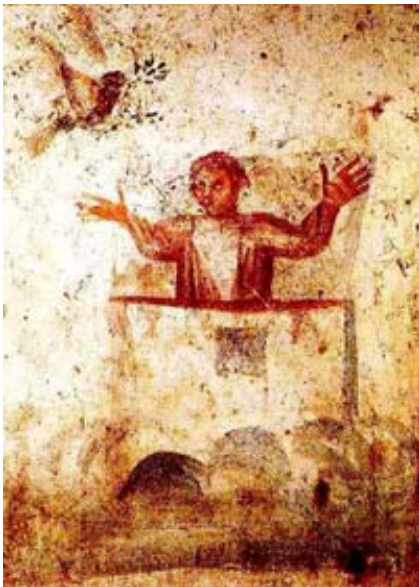
Noah and the Dove, Roman Catacomb, 2-4th century.

Then Noah built an altar to the LORD and, taking some of all the clean animals and clean birds, he sacrificed burnt offerings on it. The LORD smelled the pleasing aroma and said in his heart: "Never again will I curse the ground because of humans, even though every inclination of the human heart is evil from childhood. And never again will I destroy all living creatures, as I have done. "As long as the earth endures, seedtime and harvest, cold and heat, summer and winter, day and night will never cease."