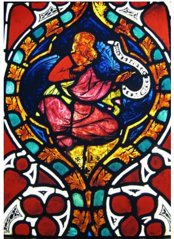
The Prophet Jeremiah. Glass painting from the Choir of the Bebenhausen Monastery, Baden-Württemberg, Germany, ca. 1335.

But you have come to Mount Zion, to the heavenly Jerusalem, the city of the living God. You have come to thousands upon thousands of angels in joyful assembly, to the church of the firstborn, whose names are written in heaven. You have come to God, the judge of all men, to the spirits of righteous men made perfect, to Jesus the mediator of a new covenant, and to the sprinkled blood that speaks a better word than the blood of Abel. See to it that you do not refuse him who speaks. If they did not escape when they refused him who warned them on earth, how much less will we, if we turn away from him who warns us from heaven? At that time his voice shook the earth, but now he has promised, “Once more I will shake not only the earth but also the heavens. The words “once more” indicate the removing of what can be shaken--that is, created things--so that what cannot be shaken may remain. Therefore, since we are receiving a kingdom that cannot be shaken, let us be thankful, and so worship God acceptably with reverence and awe, for our “God is a consuming fire.” (This is the word of the Lord - Thanks be to God )