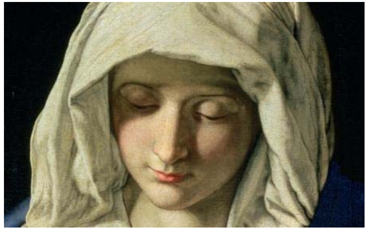
Madonna in Prayer by Sassoferrato, c1640-50

Perhaps one of the things which we need to learn from Christmas is to expect God in unlikely places. Our Bible notes this week explore just how much Christmas is about God working in spite of appearances to the contrary