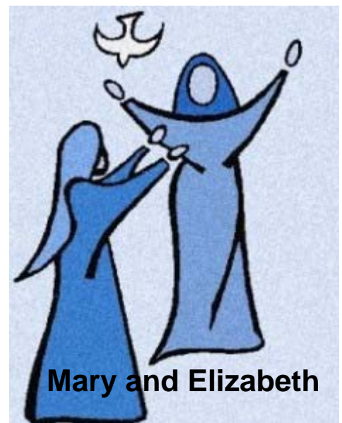
Mary and Elizabeth

And God held in his hand A small globe. Look he said, The son looked. Far off, As through water, he saw A scorched land of fierce Colour. The light burned There; crusted buildings Cast their shadows: a bright Serpent, a river Uncoiled itself, radiant With slime. On a bare Hill a bare tree saddened The sky. Many people Held out their thin arms To it, as though waiting For a vanished April To return to its crossed Boughs. The son watched Them. Let me go there, he said.