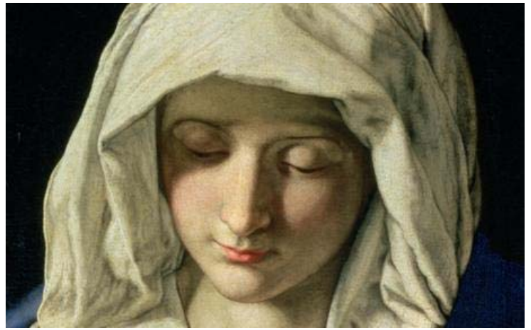
Madonna in Prayer by Sassoferrato, c1640-50

Perhaps one of the things which we need to learn from Christmas is to expect God in unlikely places. Our Bible notes this week explore just how much Christmas is about God working in spite of appearances to the contrary