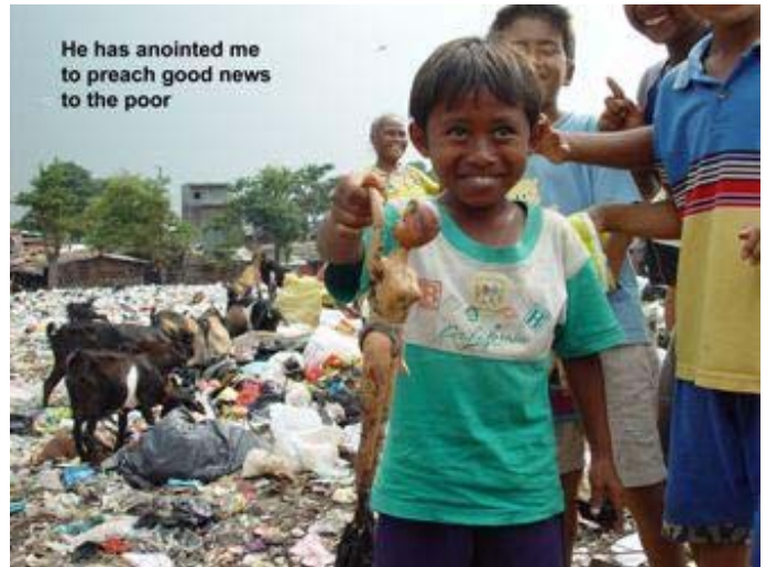
Slum life in Jakarta A young boy proudly shows his find

The body is a unit, though it is made up of many parts; and though all its parts are many, they form one body. So it is with Christ. For we were all baptized by one Spirit into one body—whether Jews or Greeks, slave or free—and we were all given the one Spirit to drink. Now the body is not made up of one part but of many. If the foot should say, "Because I am not a hand, I do not belong to the body," it would not for that reason cease to be part of the body. And if the ear should say, "Because I am not an eye, I do not belong to the body," it would not for that reason cease to be part of the body. If the whole body were an eye, where would the sense of hearing be? If the whole body were an ear, where would the sense of smell be? But in fact God has arranged the parts in the body, every one of them, just as he wanted them to be. If they were all one part, where would the body be? As it is, there are many parts, but one body. The eye cannot say to the hand, "I don't need you!" And the head cannot say to the feet, "I don't need you!" On the contrary, those parts of the body that seem to be weaker are indispensable, and the parts that we think are less honourable we treat with special honour. And the parts that are unpresentable are treated with special modesty, while our presentable parts need no special treatment. But God has combined the members of the