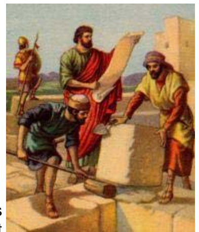
Nehemiah and the rebuilding of the walls

The Old Testament lectionary reading for this Sunday is taken from the Book of Nehemiah. Since this is not a very familiar Book it might be useful to say a little about this interesting part of the Hebrew Bible and set today's extract in context. In chronological terms, this book comes at the very end of the period covered by what we call the Old Testament. Coming historically after the book of Chronicles, it extends the story of the people of Israel from the end of the exile in Babylon (c539 BC) to the end of the fifth century BC. The account of the doings of Nehemiah is regarded as a continuation of the book of Ezra. In some places it sounds as though the book was written by Nehemiah himself, since he often uses the word "I" but in other places the text refers to the same man as "he"! Scholars have suggested that it may be that the earliest versions of the story became jumbled and thus mixed up the historical order of events in both Ezra and Nehemiah. The tone of the Book of Nehemiah is radically different from the more high flown, and perhaps more vague, outpourings of some of the prophets. Nehemiah, Jewish cup bearer to the Persian King Artaxerxes,