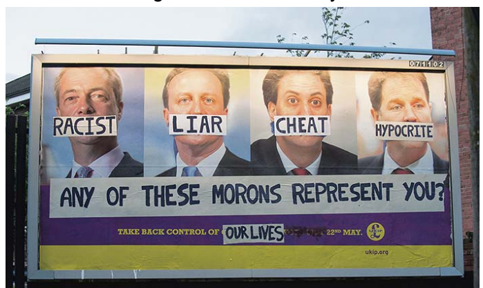
Sign of voter disaffection: a vandalised Elections billboard, in the Hyson Green area of Nottingham

Christian have been urged by all denominations to use their vote next week in the European and local elections. Britain goes to the polls on 22 May to elect 73 MEPs and thousands of local councilors, including Putnoe. Church leaders from each major denomination issued statements encouraging church people to vote on 22 May, warning that low turnouts had opened the door to extremist parties. A statement signed by leaders from the Baptists, Methodists, United Reformed Church, Roman Catholic Church, Salvation Army, and the Church of England said "Some media are dismissive about what happens in Europe but it is important in a democratic state that we make the effort to vote. It is ironic to watch people in countries like Afghanistan voting in huge numbers when people here in the United Kingdom cannot be bothered to spare a small amount of time to go to the polling station." They urged Christians to read up on the elections to make an informed choice, as well as encourage friends and family to also vote.