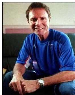
Support from Cliff Richard, a Mildmay patron

This interdisciplinary team is supported by trained volunteers and supplemented by other services as appropriate (such as dentistry and chiropody). care in partnership Members of our interdisciplinary team work in close partnership with the patient, community services and others involved in the patient's care. As a result we can ensure that each patient is linked in to the appropriate external care and support services. Wherever possible, the aim is for a return to safe, independent living.