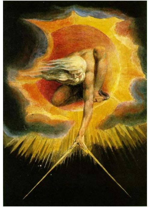
'Ancient of Days' by William Blake God creates the world and measures time

Jesus told them another parable: "The kingdom of heaven is like a man who sowed good seed in his field. But while everyone was sleeping, his enemy came and sowed weeds among the wheat, and went away. When the wheat sprouted and formed heads, then the weeds also appeared. "The owner's servants came to him and said, 'Sir, didn't you sow good seed in your field? Where then did the weeds come from?' "An enemy did this,' he replied. "The servants asked him, 'Do you want us to go and pull them up?' "No,' he answered, 'because while you are pulling the weeds, you may root up the wheat with them. Let both grow together until the harvest. At that time I will tell the harvesters: First collect the weeds and tie them in bundles to be burned; then gather the wheat and