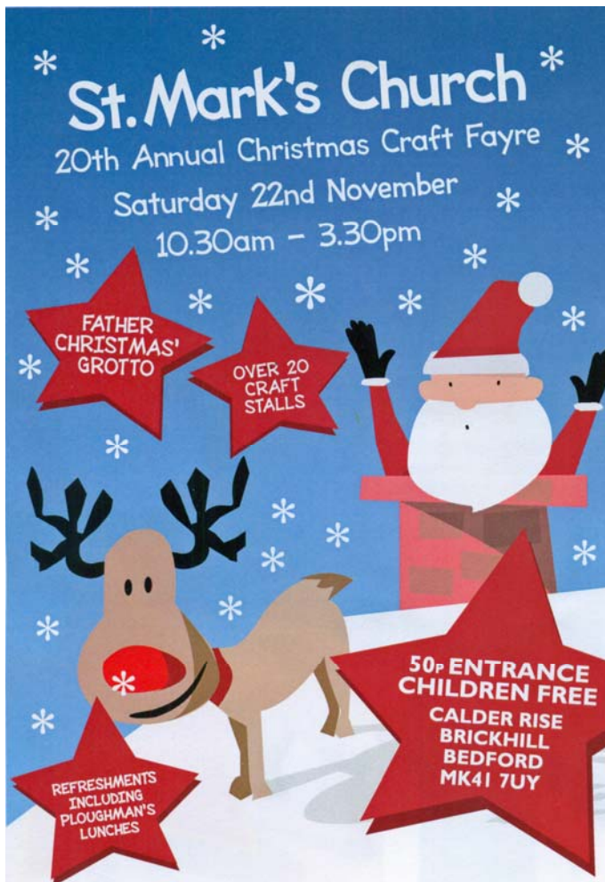
St Mark's Craft Fayre 22 November 2014

Last week to go before the Craft Fayre. Items can now be brought up to the Church. Many thanks to those who have already supported the Fayre, by taking street leaflets and delivering them. The response has been brilliant. If you live out of Brickhill area there are some leaflets left that we would be grateful if you would deliver in your street. Raffle tickets are also available to take and sell to family and friends. We have a list for a Christmas Hamper. If anyone would like to donate an item please put your name on the list. If we get duplicates we will pass on to the Raffle itself. We will be setting up on Friday at around 4.30p.m. There is always lots to do with setting up the tables, creating a Father