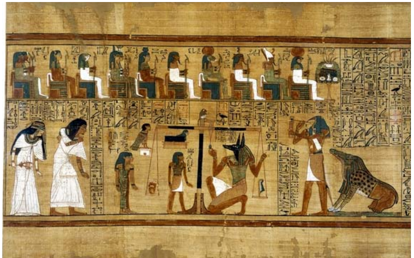
Weighing the heart From Thebes, Egypt 19th Dynasty, around 1275 BC

appear in power and great glory we may be made like him in his eternal and glorious kingdom; where he is alive and reigns with you, in the unity of the Holy Spirit, one God, now and for ever