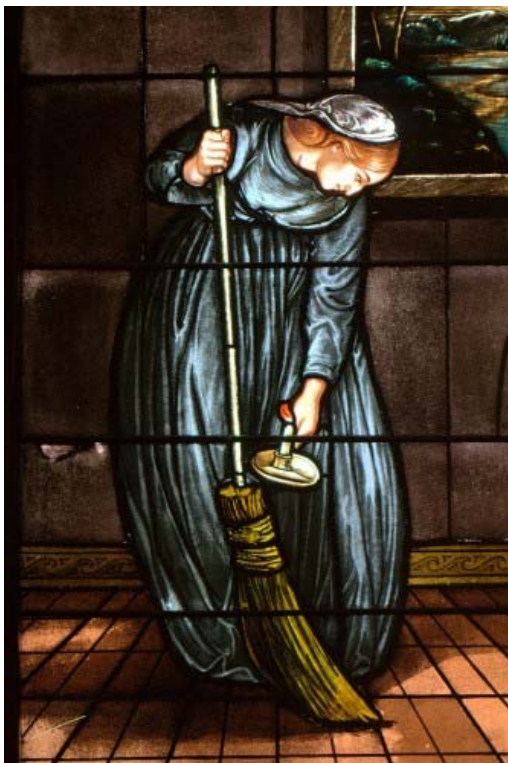
The lost coin in stained glass