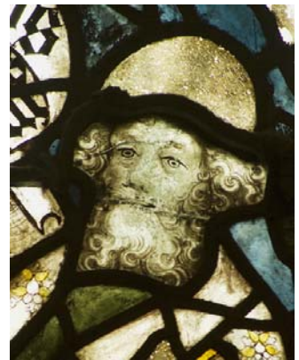
Amos, York Minster