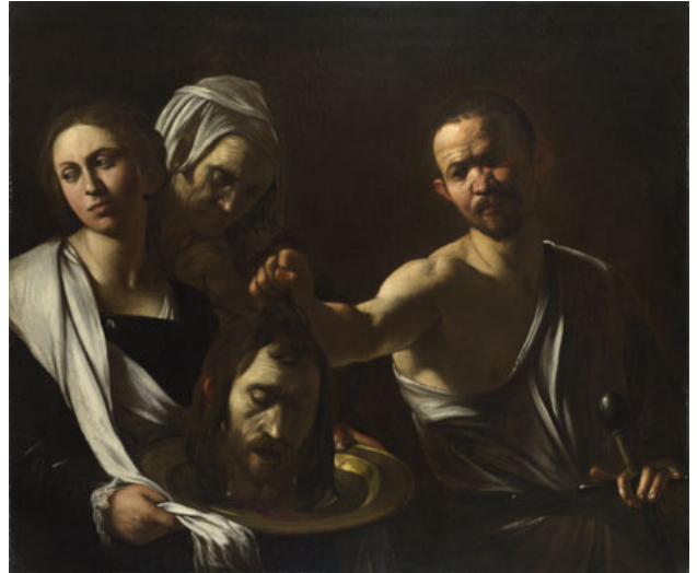
Beheading of John the Baptist, Caravaggio

Eternal God, giver of love and peace, you call your children to live together as one family. Give us grace to learn your ways and to do your will, that we may bring justice and peace to all people, in the name of Jesus Christ. Amen Methodist Worship