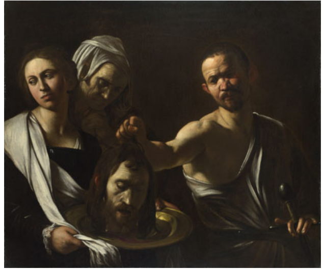
Beheading of John the Baptist, Caravaggio

Eternal God, giver of love and peace, you call your children to live together as one family. Give us grace to learn your ways and to do your will, that we may bring justice and peace to all people, in the name of Jesus Christ. Amen Methodist Worship