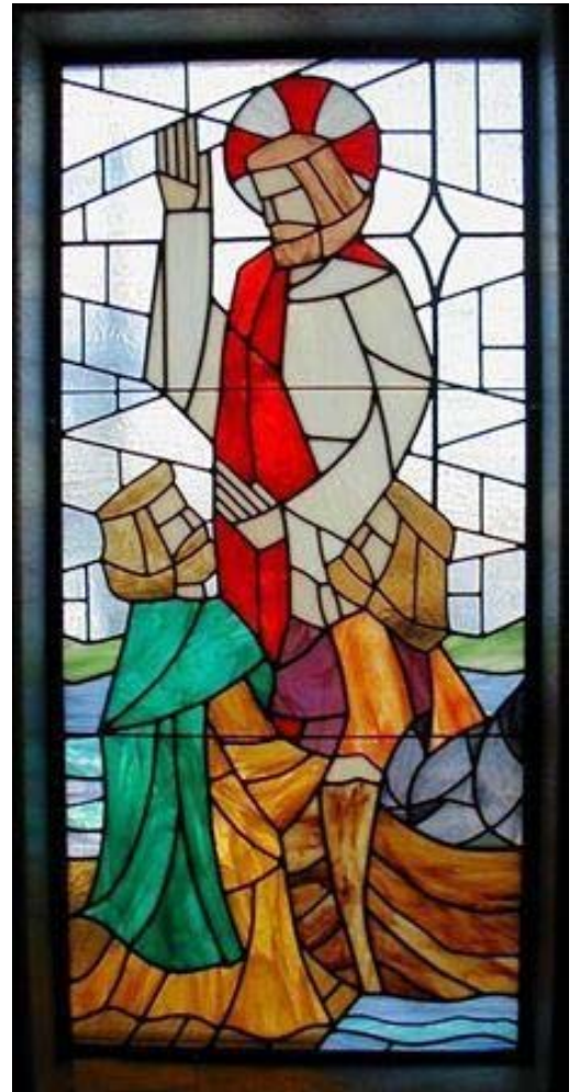
The calling of the fisherman, from St Hilary's Church, Los Angeles

Then I saw in the right hand of him who sat on the throne a scroll with writing on both sides and sealed with seven seals. And I saw a mighty angel proclaiming in a loud voice, "Who is worthy to break the seals and open the scroll?" But no-one in heaven or on earth or under the earth could open the scroll or even look inside it. I wept and wept because no-one was found who was worthy to open the scroll or look inside. Then one of the elders said to me, "Do not weep! See, the Lion of the tribe of Judah, the Root of David has triumphed. He is able to open the scroll and its seven seals." Then I saw a Lamb, looking as if it had been slain, standing in the centre of the throne, encircled by the four living creatures and the elders. He had seven horns and seven eyes, which are the seven spirits of God sent out into all the earth. He came and took the scroll from the right hand of him who sat on the throne. And when he had taken it, the four living creatures and the twenty-four elders fell down before the Lamb. Each one had a harp and they were holding golden bowls full of incense, which are the prayers of the saints. And they sang a new song: "You are worthy to take the scroll and to open its seals, because you were slain, and with your blood you purchased men for God from every tribe and language and people and nation. You have made them to be a kingdom and priests to serve our God, and they will reign on the earth" (Reader: This is the word of the Lord - All: Thanks be to God )