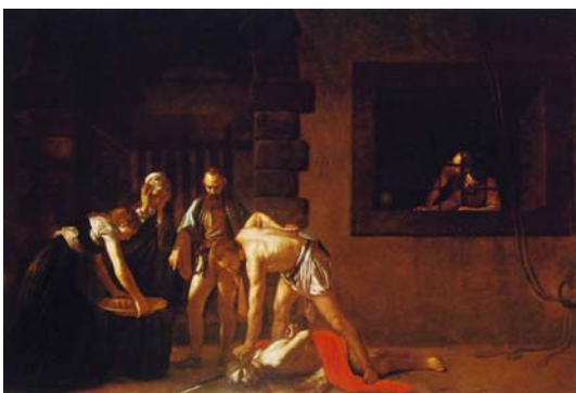
The beheading of John, Caravaggio

Whereas John's father had been part of the religious establishment as a priest in the Jerusalem temple, John fled the comforts and corruptions of the city for the loneliness of the desert. There he dressed in animal skins, ate insects and wild honey, and preached. Living on the margins of society, both literally and figuratively, he preached "a baptism of repentance for the forgiveness of sins" (Mark 1:4).