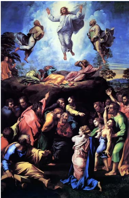
The Transfiguration by Raphael