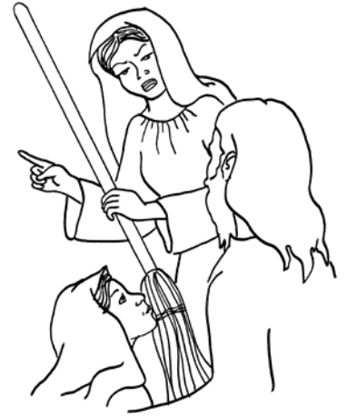
"Jesus Visits Mary and Martha." Luke 10:38-42

As Jesus and his disciples were on their way, he came to a village where a woman named Martha opened her home to him. She had a sister called Mary, who sat at the Lord's feet listening to what he said. But Martha was distracted by all the preparations that had to be made. She came to him and asked, "Lord, don't you care that my sister has left me to do the work by myself? Tell her to help me!" "Martha, Martha," the Lord answered, "you are worried and upset about many things, but only one thing is needed. Mary has chosen what is better, and it will not be taken away from her." (Reader: This is the Gospel of Christ - All: Praise to Christ our Lord Amen )