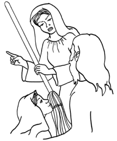
"Jesus Visits Mary and Martha." Luke 10:38-42

As Jesus and his disciples were on their way, he came to a village where a woman named Martha opened her home to him. She had a sister called Mary, who sat at the Lord's feet listening to what he said. But Martha was distracted by all the preparations that had to be made. She came to him and asked, "Lord, don't you care that my sister has left me to do the work by myself? Tell her to help me!" "Martha, Martha," the Lord answered, "you are worried and upset about many things, but only one thing is needed. Mary has chosen what is better, and it will not be taken away from her." (Reader: This is the Gospel of Christ - All: Praise to Christ our Lord Amen )