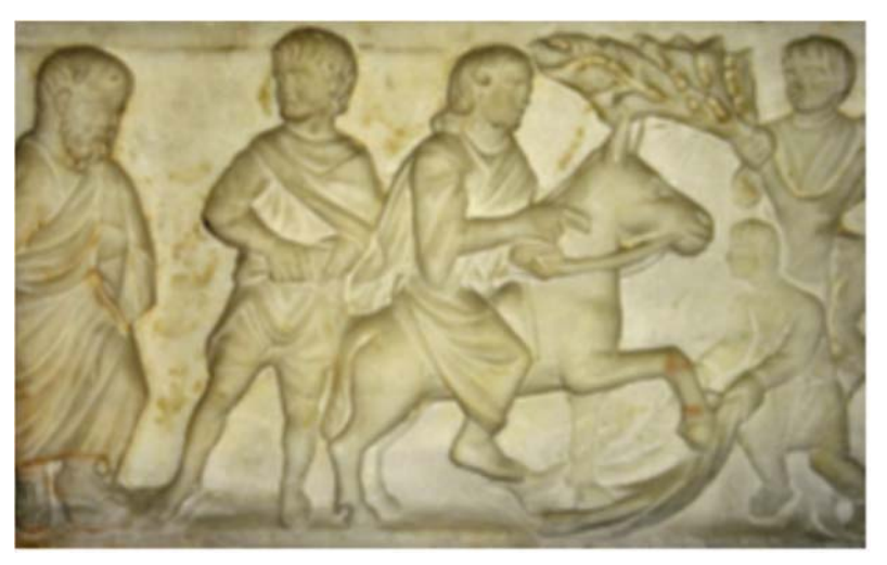
Christ's entrance into Jerusalem third century Rome